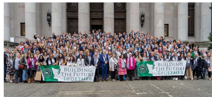
Hundreds of REALTORS® from across the state participated in Washington REALTORS® Hill Day 2025.