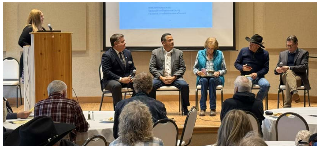
Fire Insurance Town Hall Panel — Cle Elum